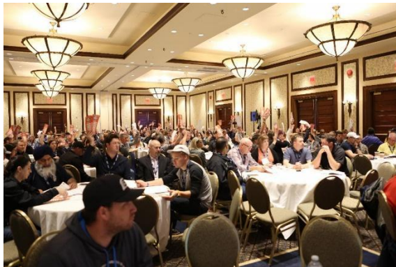
Annual General Meeting (AGM)

Female Development: "Beyond the Barriers" Throughout the seminar we will focus on how we can progress female hockey beyond what that current issues are. We have identified the concerns in female hockey, now let's focus on creating opportunities for our female players, coaches and officials. Through this interactive seminar with your Female Zone Leads we will work through a number of scenarios to map out a critical path and some events for female hockey in your Districts.